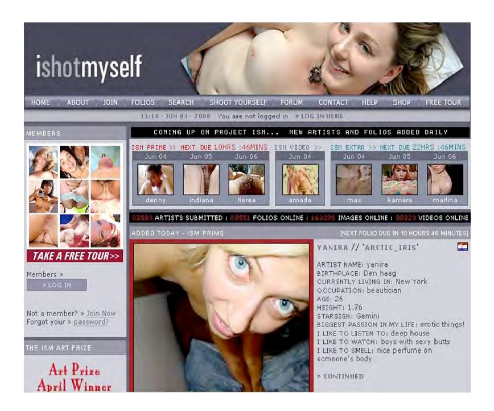
Ill. 5: I Shot Myself - homepage 2008

reductionist discussion which came to the conclusion that really, the eroticism is mostly in the face, and it stood to reason that you could make porn with no nudity. So we passed a video camera around amongst a few friends and ISM contributors, and the ISM designer whipped up a simple, but elegant site."<sup>30</sup>