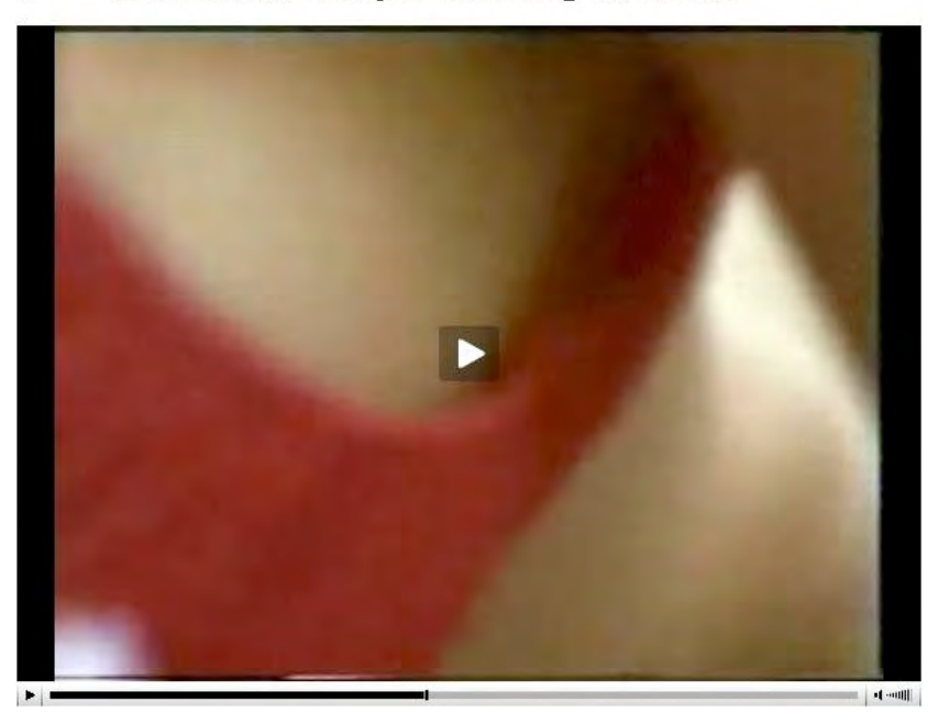
Ill. 2: Video and Thumbnail "Amateur Couple fucking in H & M" on: YouPorn

They are by no means 'heavenly bodies' who perform sexually here. Quite the opposite: even among the search categories offered in YouPorn we find explicit attributes such as "mature", "elderly", "fat", "hairy" etc.<sup>14</sup> Users generate the precedence of certain products by means of "ranking". This is the term for the key process of description and selection on the Internet. It categorizes products as the "top rated" and "most viewed" and in this way influences users' selection. What at first appears to have technical and dramaturgic shortcomings and seems crude (category "beginners"), emerges, on closer scrutiny, without a doubt as a constituent of a new heteronormative image aesthetic of the "home made", which websites advertise explicitly with titles such as "Amateur Couples".